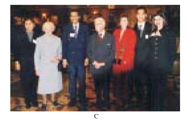
Fig. 2: Sir Harold Ridley was awarded for being one of the most influential ophthalmologists of 20^{\rm th} century. This event commemorated the 50 ^{\rm th} Anniversary of the IOL.